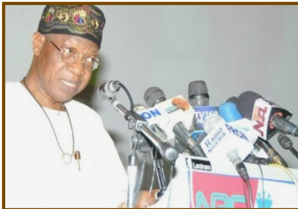
Lai Mohammed Minister of Information

The Minister of Information and Culture, Alhaji Lai Mohammed, while inaugurating a Steering Committee for the Reform and Commercialisation of the Corporation in Abuja