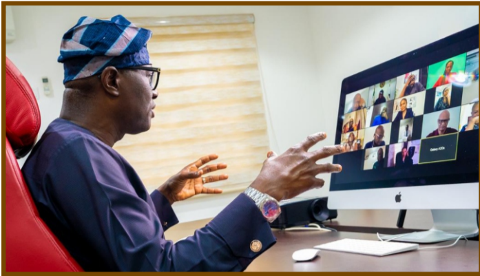
Babajide Sanwo-Olu Lagos State Governor

T he negative effects of the COVID-19 impact on the media businesses in Nigeria has not gone unnoticed.