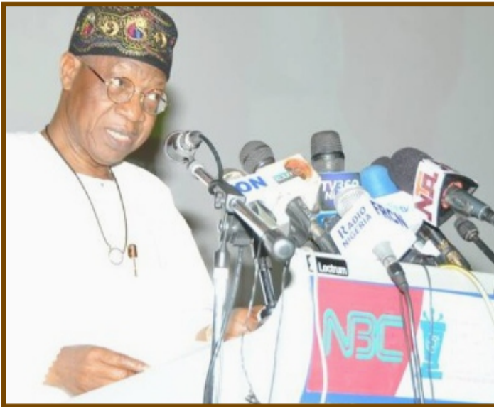
Lai Mohammed Minister of Information

The chances for the expected palliatives from the government to the media amid the devastating COVID-19 pandemic on media business has brightened as the Newspapers Proprietors Association of Nigeria, NPAN is responding to the Federal Government directive to send in a submission.