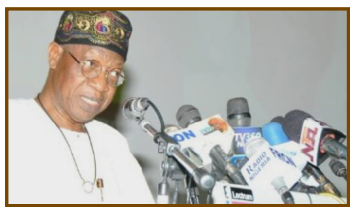
Lai Mohammed Minister of Information and Culture

he Federal Government has said that, "any speech, broadcast or publication that denigrates a person, a group of people on the basis of their sex, religion, political belief or origin is hate speech".