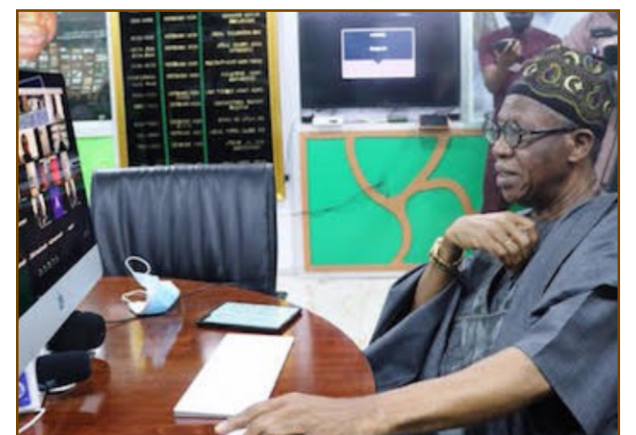
Lai Mohammed, Minister of Information and Culture

But let me say here that even at that, the situation is different because newspapers don't pay renewal licence fee."