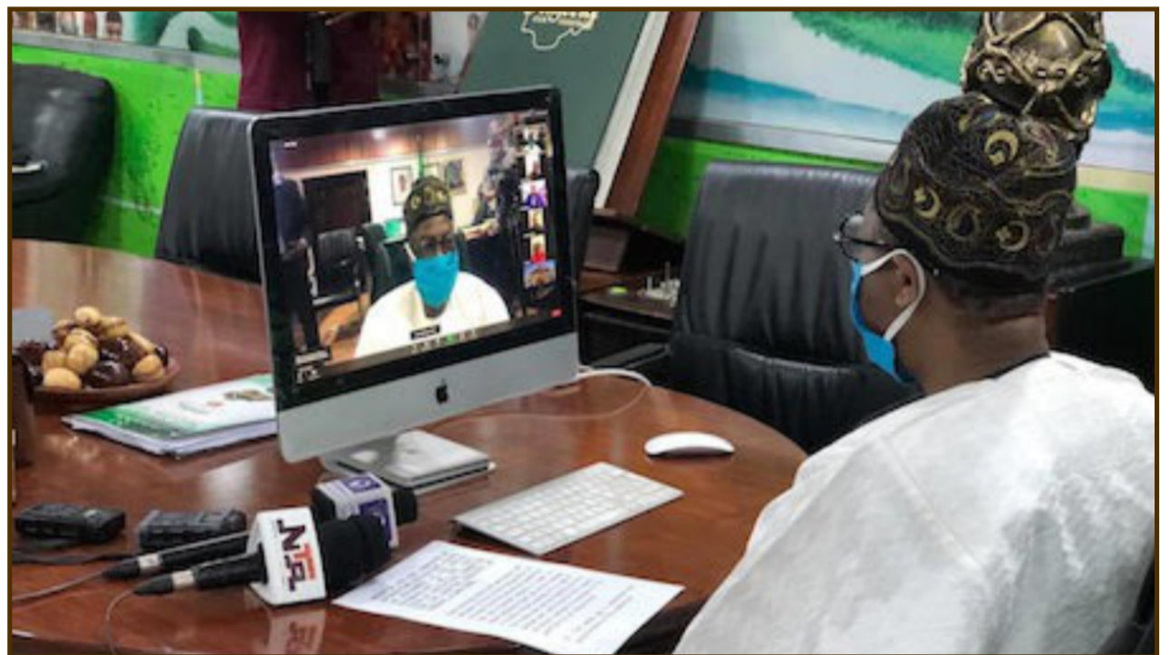
The Minister of Information and Culture, Alhaji Lai Mohammed, while inaugurating the Post-Covid-19 Initiatives Committee for the Creative Industry virtually from his office in Abuja on Tuesday