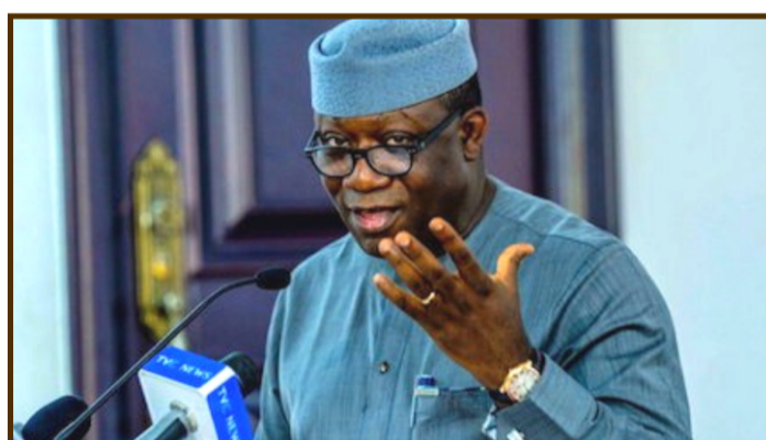
Governor Kayode Fayemi of Ekiti State

In his bid to ensure full broadband connectivity in the state and beyond, the Governor of Ekiti State, Dr Kayode Fayemi, recently signed an Executive Order reducing the Right of Way charges for telecommunication infrastructure from N4,500 to N145 per linear metre.