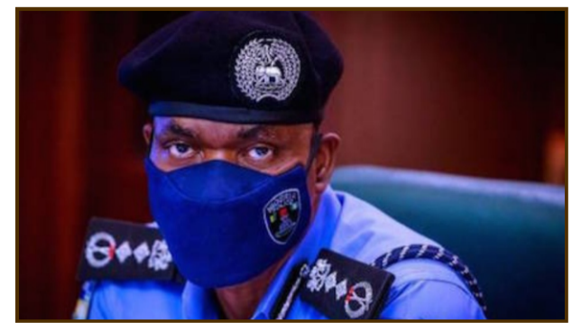
Inspector General of Police, Mohammed Adamu

He stated that the Union had communicated its demand to President Buhari, adding, "asking for assistance from the government by way of bailout was not an indication that the media had sold its conscience."