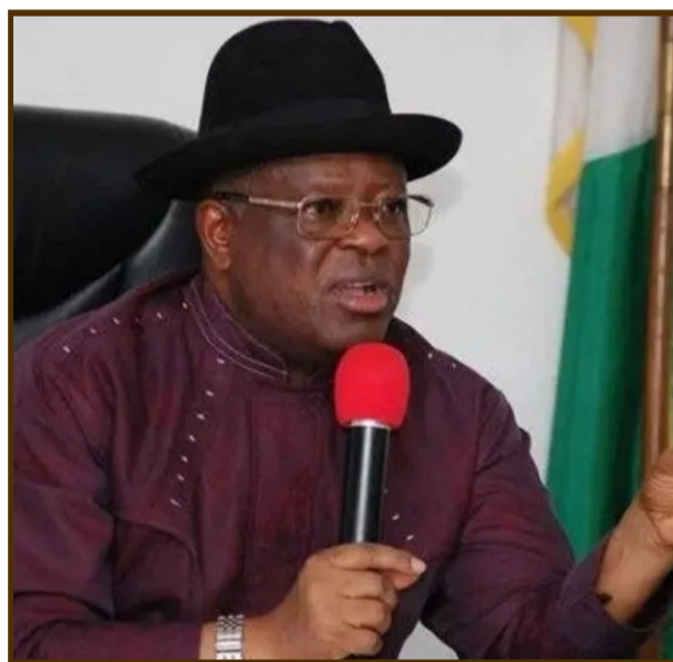
Governor David Umahi of Ebonyi State

G ov. David Umahi of Ebonyi has directed journalists and security personnel covering his activities and the state government's meetings to go for COVID-19 tests.