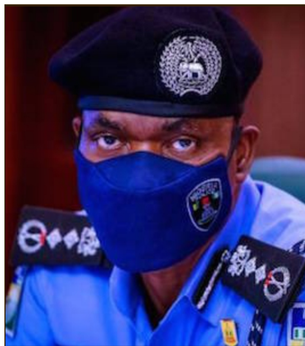
Inspector General of Police, Mohammed Adamu

The Foundation called for the review of the Nigeria Police Force COVID19 guidelines with more procedure in dealing with election