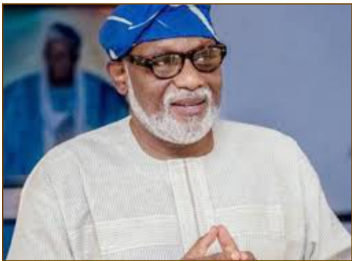
Governor Rotimi Akeredolu of Ondo State

Ahead of the full resumption of sporting activities, the Ondo government, has banned viewing centres from operating in the state.