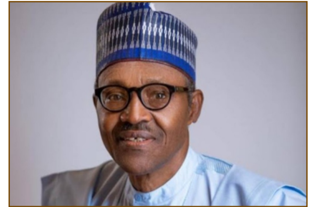
President Muhammadu Buhari

President Muhammadu Buhari has said the government will continue to guarantee press freedom in the country and harness the power of the media for positive development.